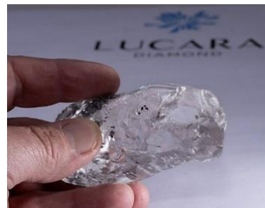
The 1,080-carat Eva Star diamond

This 1,080-carat Eva Star diamond is a rare Type IIa. Along with the Sethunya (discovered in 2015), this extraordinary diamond made a record-breaking sale for $54 million in 2025.