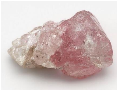
Half Pink rough diamond has distinct pink and colourless zones.

Natural pink diamonds are among the most coveted and rare gemstones on Earth. Unlike blue or yellow diamonds, whose colours come from trace elements like boron or nitrogen, pink colour arises due to rare internal distortion of diamond lattice or plastic deformation caused by precise geological conditions under earth.