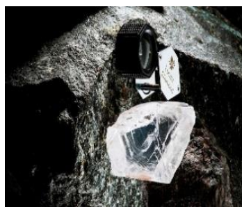
The "Constellation" diamond

The 813-carat Constellation Diamond is another most significant discovery made in recent times. It was found at the Karowe mine in Botswana in 2015 and was sold for a record price of $63.1 million, which amounts to nearly $78,000 per carat.