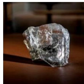
1,094-carat Seriti Diamond

The 1,094-carat diamond, found in 2024. It was the world's sixth-largest gem-quality