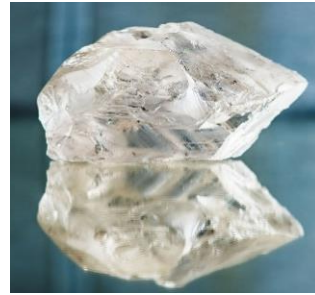
470-carat light brown diamond

This 470-Carat rare light brown diamond was one of six the diamonds recovered at the Karowe mine in 2021. Multiple polished stones were made from it.